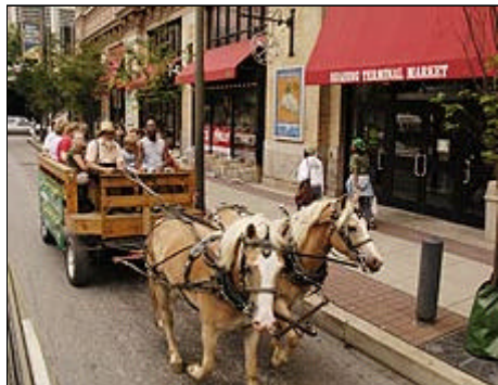
Customers enjoy a free ride in a horse-drawn wagon outside Reading Terminal Market in Philadelphia during last year's Pennsylvania Dutch Festival.